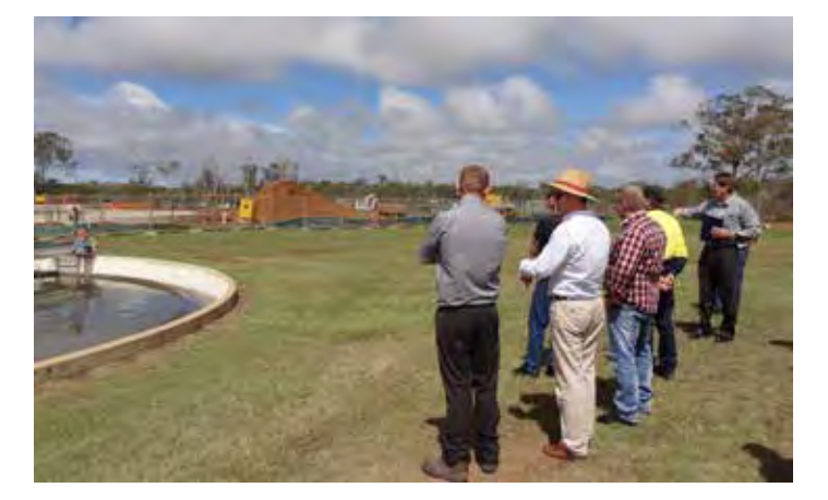
Lovers Walk Water Treatment Plant