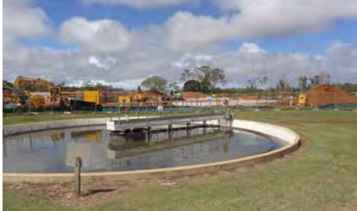
Branyan Water Treatment Plant